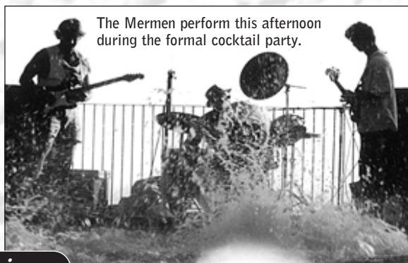
The Mermen perform this afternoon during the formal cocktail party.

It's hard to believe that just three guys can make such a lush, rich sound. Bass, drums, guitar—that's it. There must be a sub-ether sounding board in there somewhere. Slow it down to a deep-sea pace, then bring it back around to surface in the Black Rock Desert.