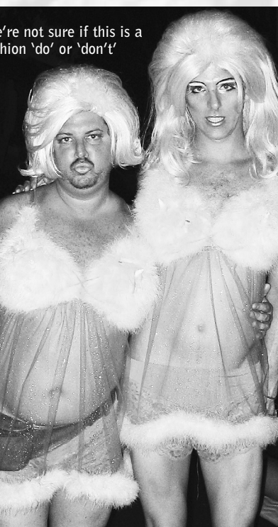
We're not sure if this is a fashion 'do' or 'don't'

3. A great costume can be comfortable. Certain outfits are designed by exotic cultures to work well in the